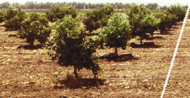
3 YEAR OLD LEMON TREE WITHOUT TAL-YA TRAY